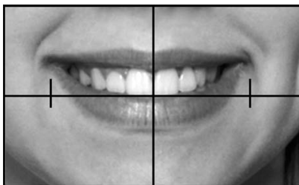
Fig 1. A standardized smile image using the 3 × 5-in template.

The nonorthodontic panel comprised 20 parents whose children were undergoing orthodontic treatment